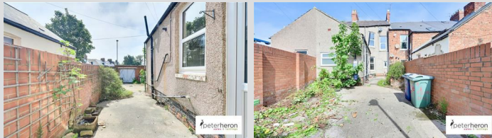
Town garden to the front. Low maintenance courtyard to the rear with shutter door providing off street parking.